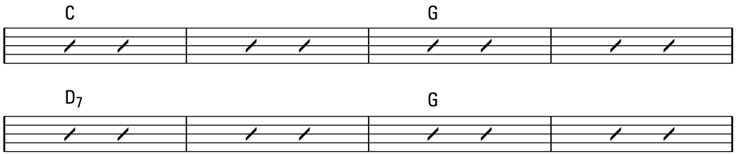
TAB 4-1: Strumming along to “This Land”-type chord progression using G, C, and D7 chords.